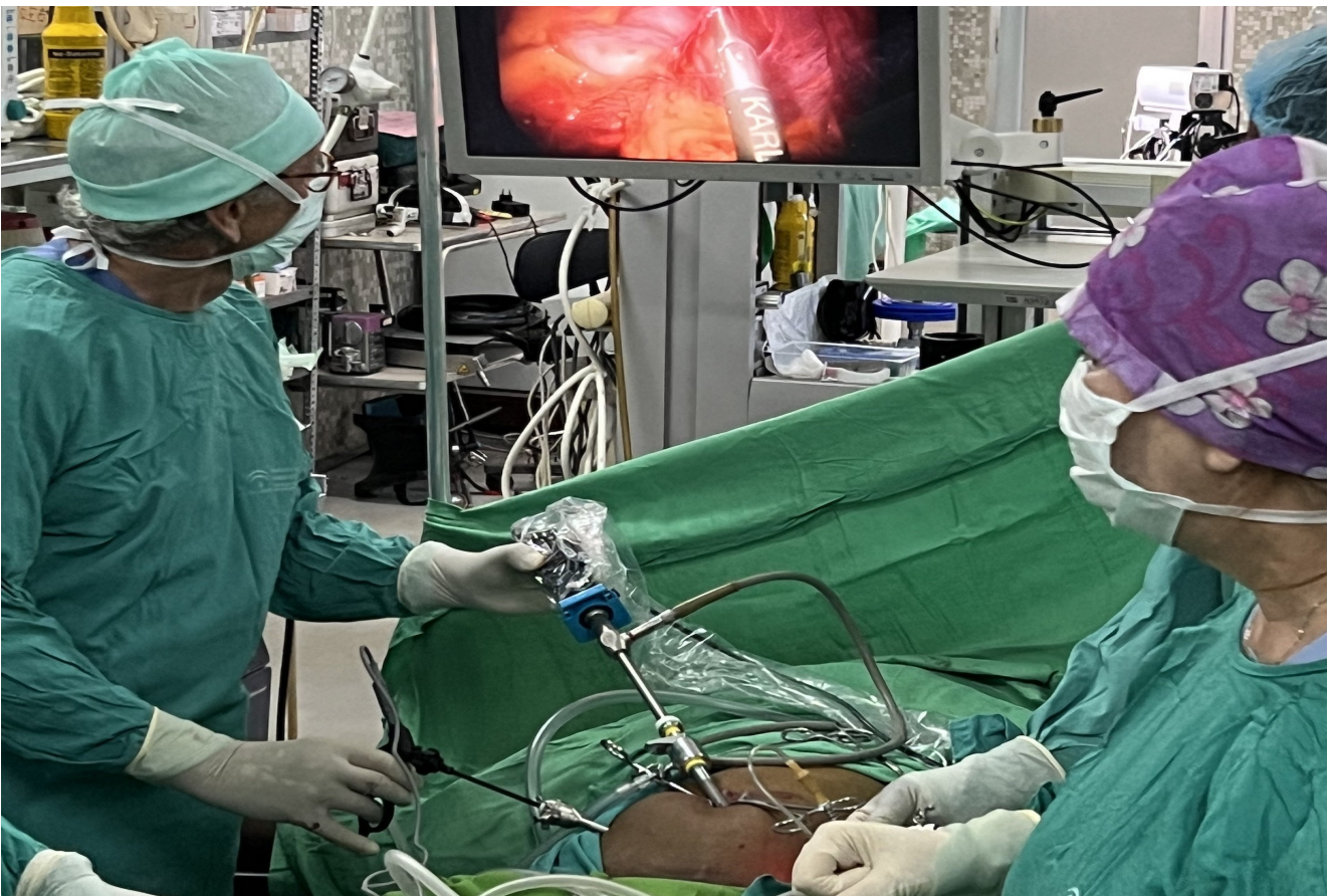
1st laparoscopic operation in Tanguiéta in April 2023

Laparoscopy requires CO 2 , which until now has been a limiting factor. This gas is now produced in Cotonou, solving supply problems.