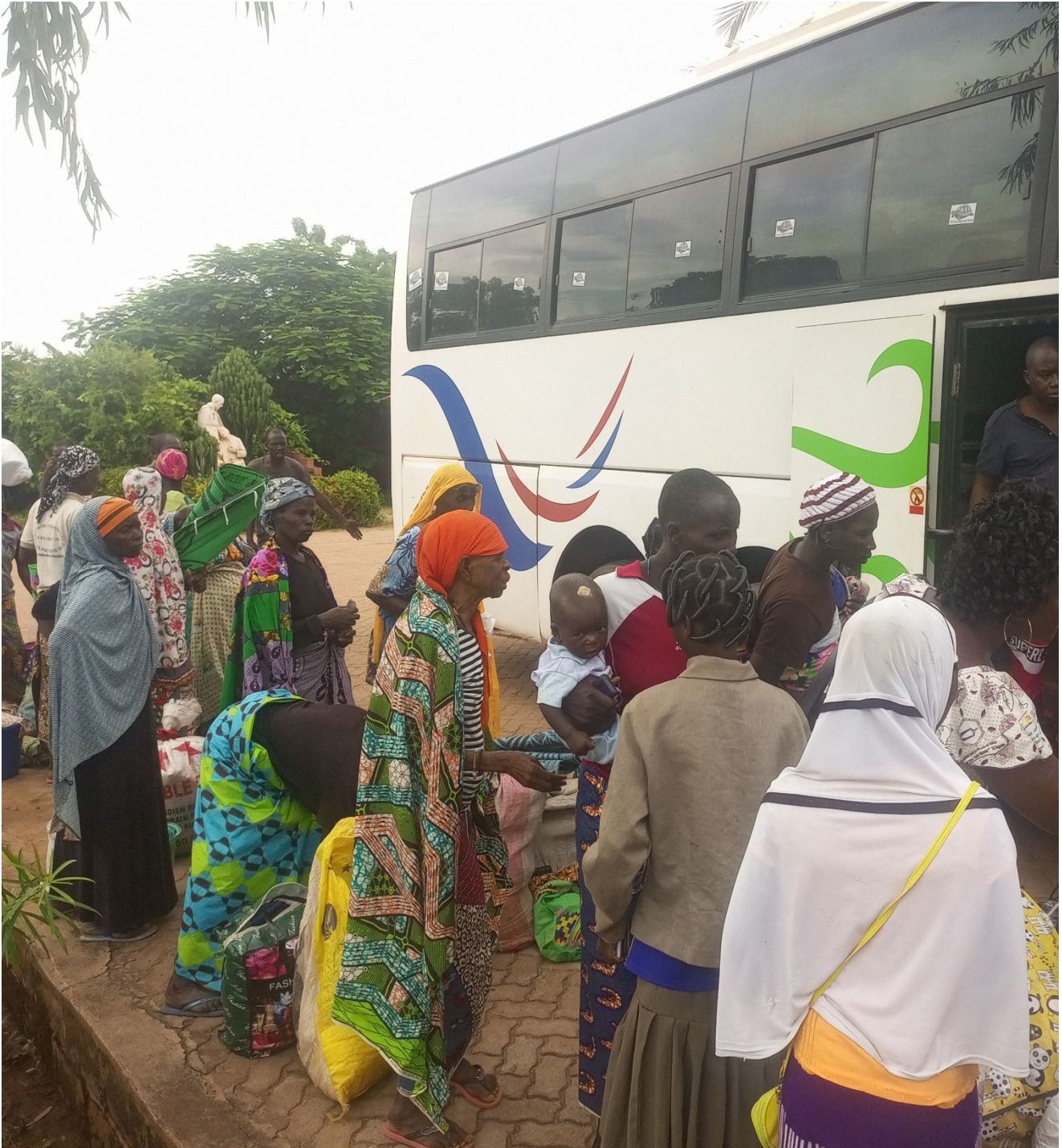
Patients came mainly from the eastern and Sahelian regions, which are subject to a high level of insecurity, impacting on the use of health services.