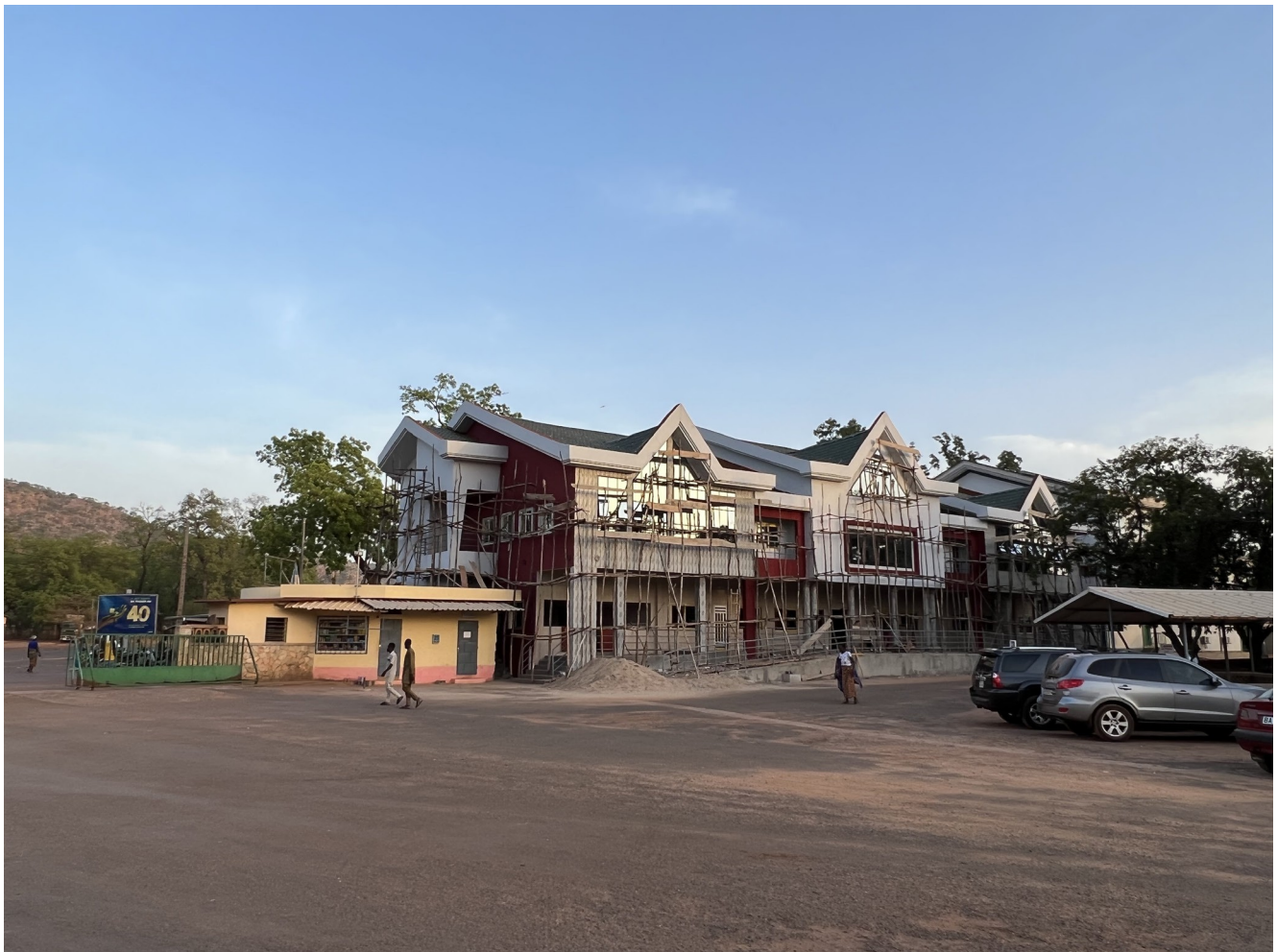
Renovation of clinic building

The Foundation would also like to thank Medtronic and Anklin for their material support.