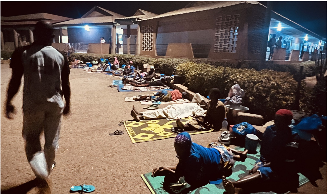
Companions sleeping in the courtyard of Hôpital Saint Jean de Dieu